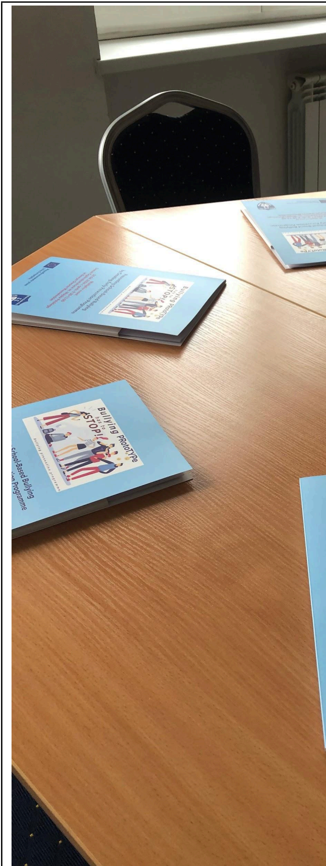
A poster advertising PROTOTYPE Multiplier event