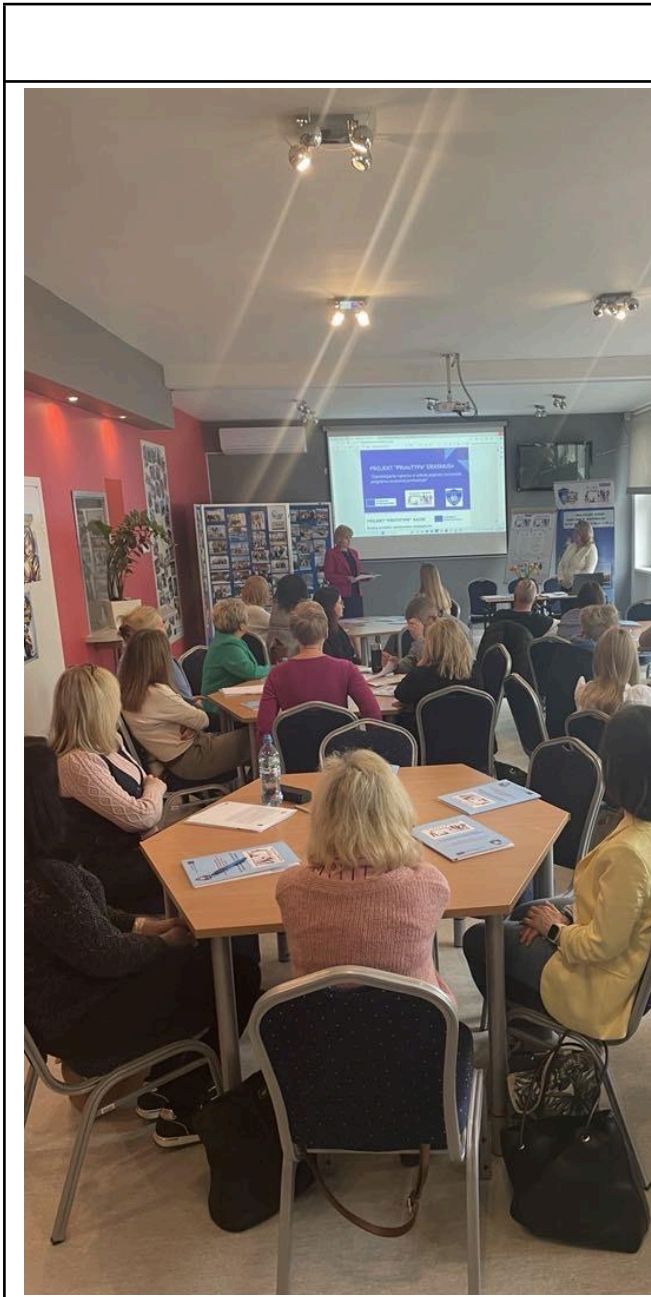
promotional gift picture (Flash Drive, Notebook, pen etc)